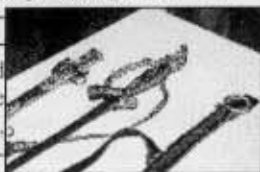
(Sword with belt and scabbard)

The sword originally belonged to John L. Worden, the commander of the Monitor when it battled the Confederate warship Virginia, also called the Merrimack, on March 9, 1862.