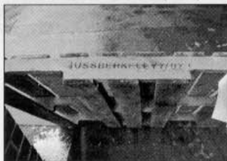
Pallet from the West Coast (below).