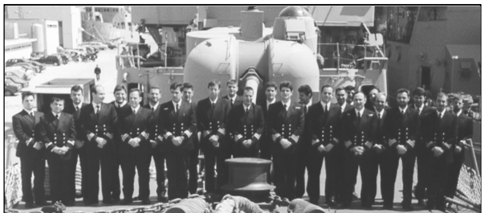
The officers of HS Themistocles (DDG-221)