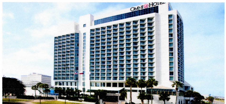
Photos: Top to Bottom - USS Lexington (CV-16), Naval Air Station, Corpus Christi, the Omni Hotel